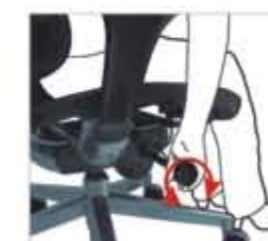
Backrest flexible tilt tension adjustment