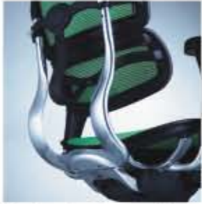
Aluminum back support frame