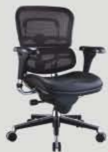
EH-LBM-L Back mesh & Seat leather