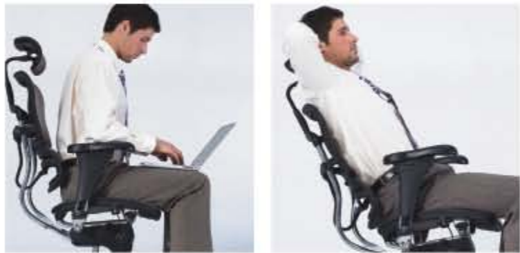
It would automatically adjust the angle of lumbar for any sit posture.