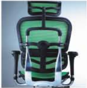
Unique backrest outline