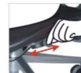
Backrest tilt angle adjustment