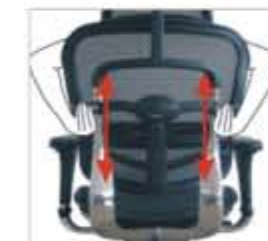
Backrest height adjustment