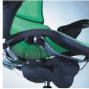
Wire control synchro mechanism