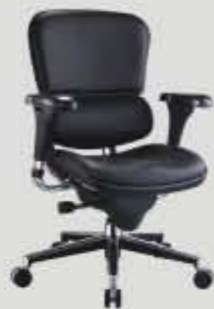
EH-LAL All leather