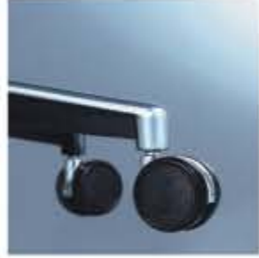
Aluminum base & 65mm PU caster