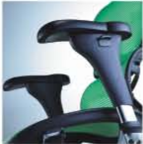
Creative adjustable armrest