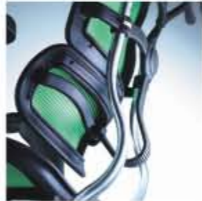
Flexibility lumbar support structure