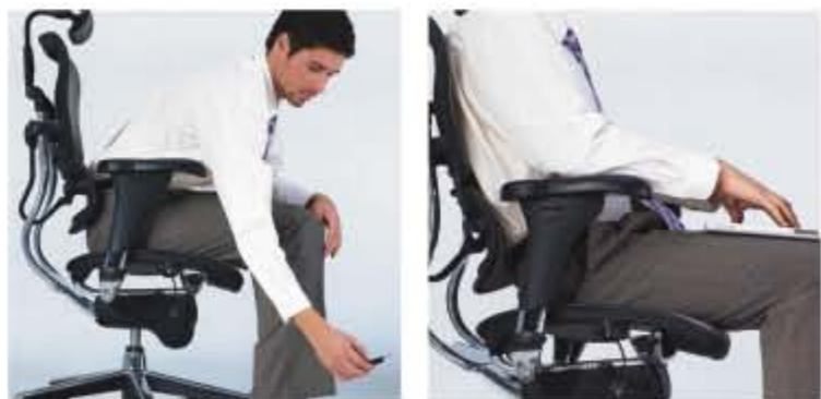
Even you leave the chair back to work, the lumbar could always keep to support.