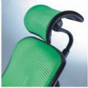
Separate camber headrest design