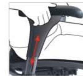
Armrest height adjustment