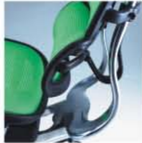
Separate lumbar support design