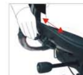
Seat depth adjustment