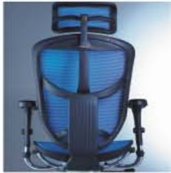
Unique backrest outline