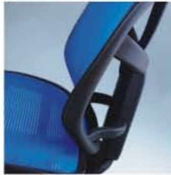
Backrest adjustment structure