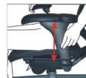
Armrest height adjustment