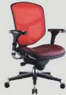
EJ-LBM-L Back mesh & Seat leather