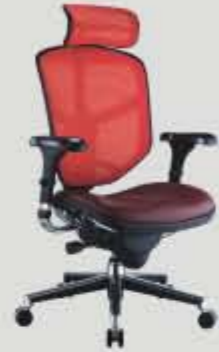
EJ-HBM-L Back mesh & Seat leather