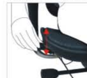
Seat height adjustment