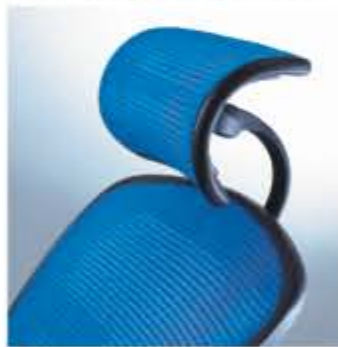
Separate camber headrest design