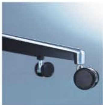
Aluminum base & 60mm caster