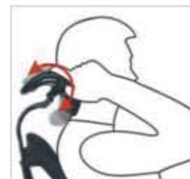
Headrest angle adjustment