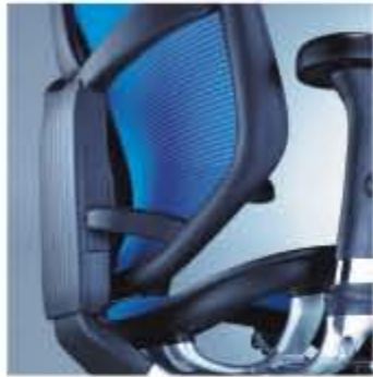
Streamline shape backrest