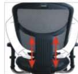
Backrest height adjustment