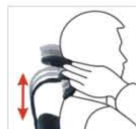
Headrest height adjustment