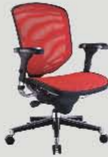
EJ-LAM All mesh