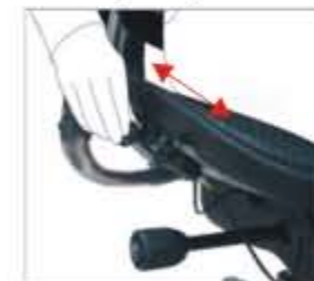
Seat depth adjustment