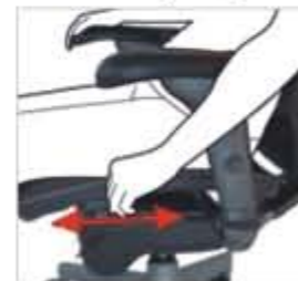
Backrest tilt angle adjustment