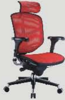
EJ-HAM All mesh