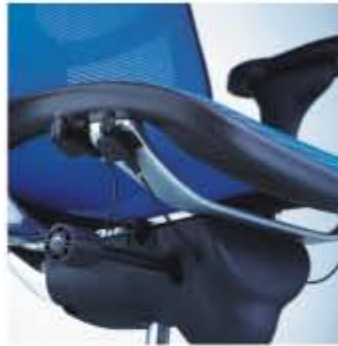
Wire control synchro mechanism