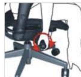
Backrest flexible tilt tension adjustment